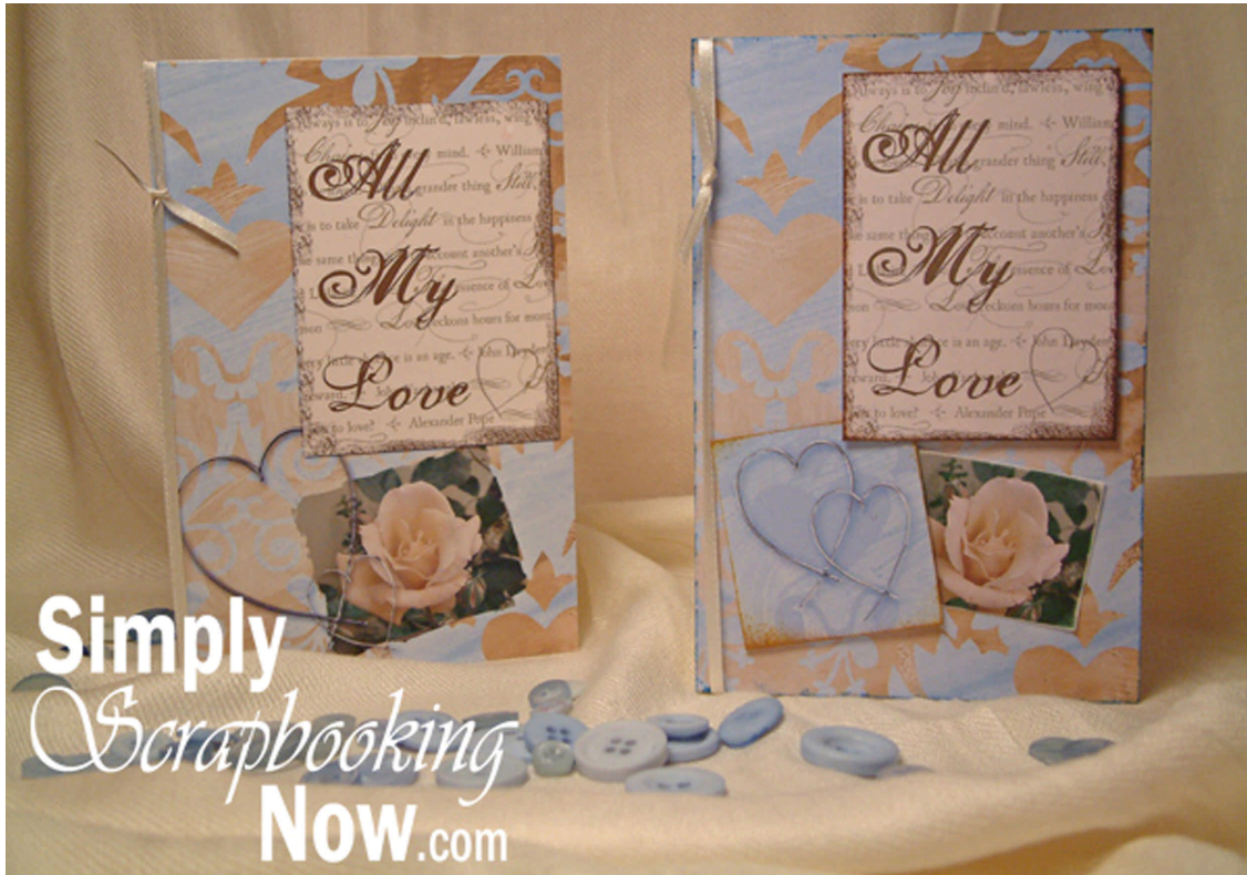
Photo shows downloadable “QuickCard” jpeg printed onto photo paper (left) and the finished hybrid card (right)

Part of the “I can Craft Now” Range of Printable Kits